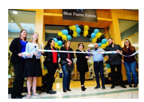
Blue Flame Events Retail Store

The spring has been busy with grand opening/ribbon cutting ceremonies! Below are pictures from April events and the next ceremony will take place this Sunday, May 5th for Stone Lake Winery at All Aspects at the Barn at 1:00pm! Come out to these events to support your fellow Chamber members!